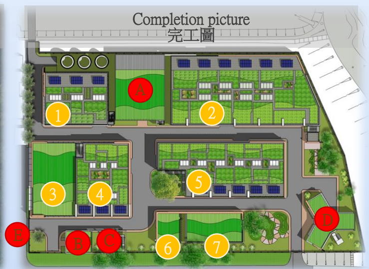
Completion picture 完工圖