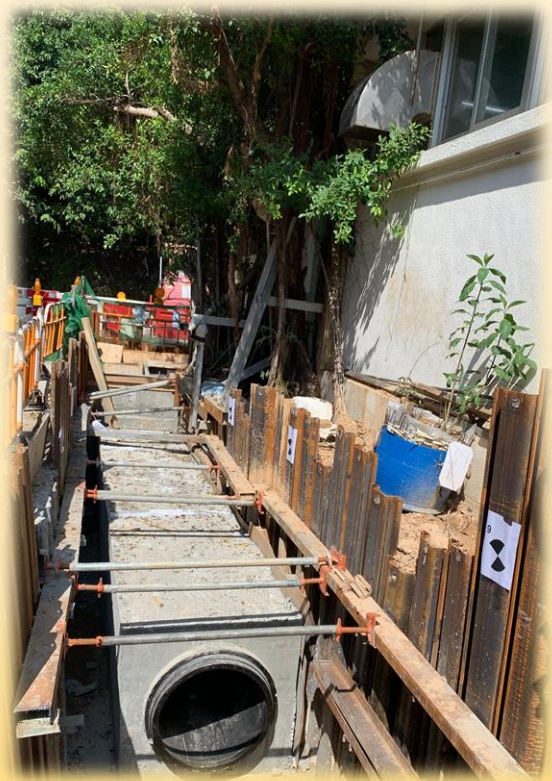
Upgrading of Sewers. 污水渠改善工程。