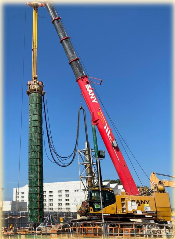
Construction of Foundation. 地基工程。

Cheung Chau Sewage Treatment Works 長洲污水處理廠